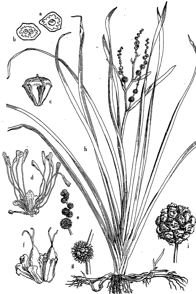
Sparganiaceae Fig. 1. Sparganium eurycarpum . a and b, 1-seeded and 2-seeded fruits (cross sections), \times 1.5 ; c, mature fruit, \times 1.5 ; d, paired staminate flowers, usually with 1 broad perianth scale and several long-clawed scales expanding into a spatulate apex, the anthers elliptic clavate, \times 6 ; e, staminate inflorescence showing globose heads, \times 0.2 ; f, young, sessile pistillate flowers, showing the perianth scales with spatulate apex, the scales broader than those of the staminate flowers, \times 4 ; g, young fruit cluster, \times 0.66 ; h, habit of plant, \times 0.12 ; i, mature fruit cluster, the styles broken off, \times 0.8 . Reproduced with permission from A Flora of Marshes of California by Herbert L. Mason (1957), University of California Press, Berkeley. Copyright (c) 1957 Regents of the University of California, (c) renewed 1985 Herbert Mason.