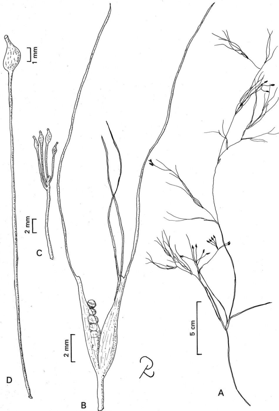
Ruppiaceae. Figure 2. Ruppia cirrhosa . A) Habit. B) Flowering branch (incl. a spicate inflorescence partially enclosed in a spathe and emerging new leaves). C) Cluster of single-carpel fruits from one flower. D). Single stalked fruit of one carpel. [Drawn by Jon Ricketson].