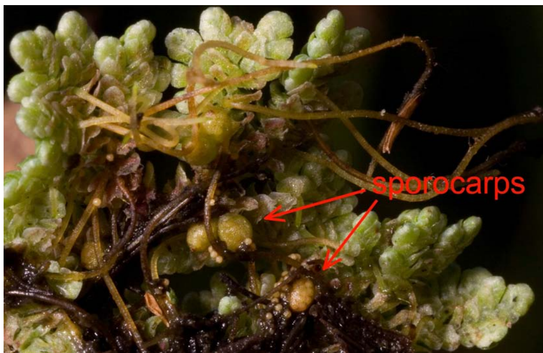
Azollaceae Figure 2. Azolla filiculoides , closeup of abaxial side with microsporocarps.