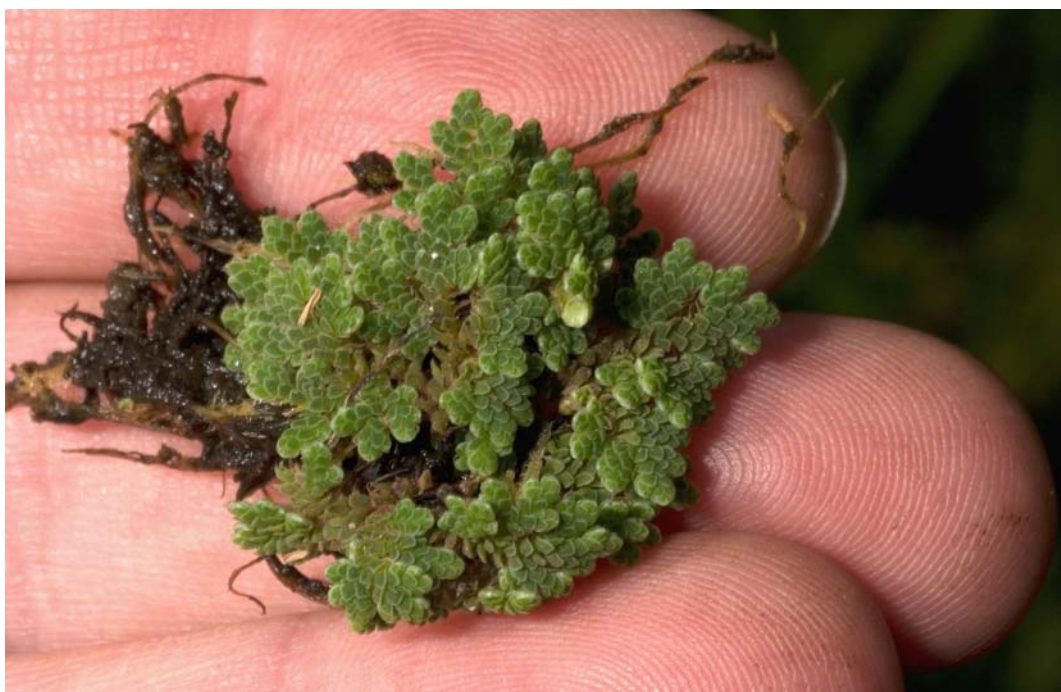
Azollaceae Figure 3. Azolla filiculoides , group of plants adaxial side.