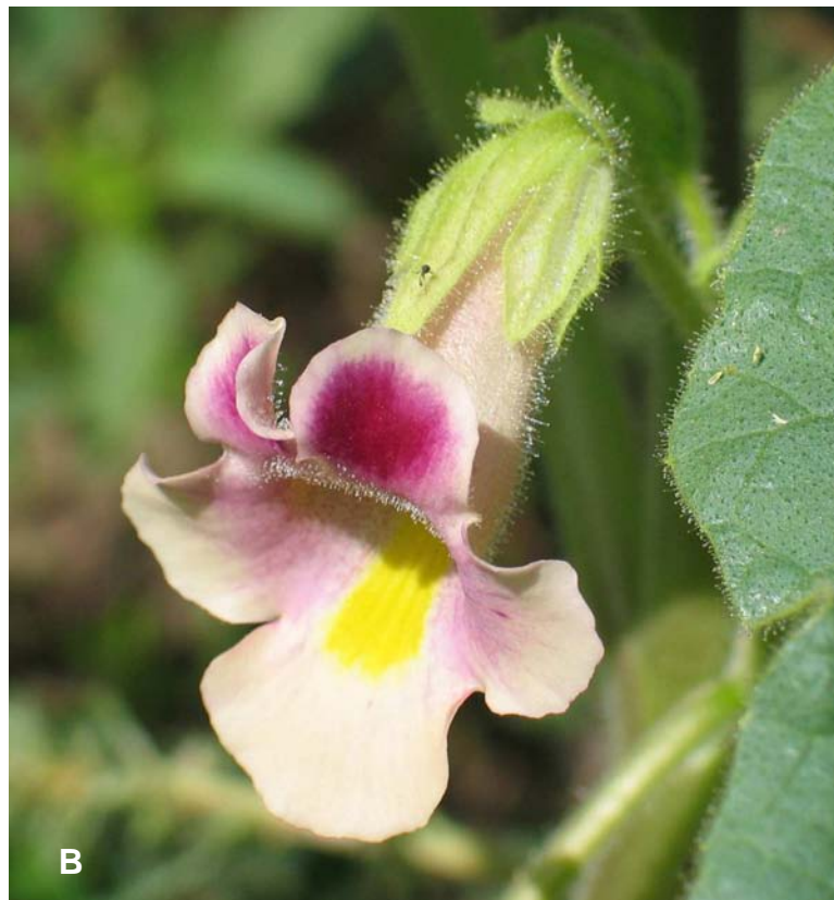
Martyniaceae Figure 2. Proboscidea : (A) P. althaeifolia , flower; (B) P. parviflora , flower.