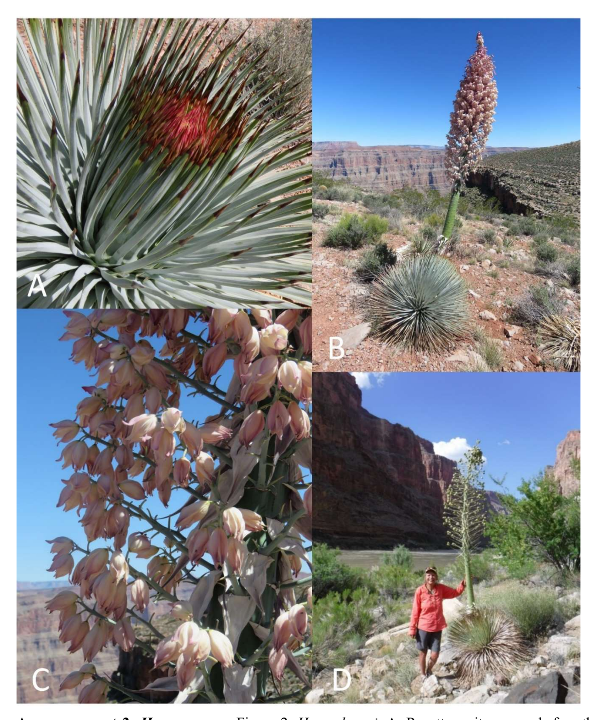
Agavaceae part 2: Hesperoyucca. Figure 2. H. newberryi . A. Rosette as it appears before the flower stalk bolts, the photo taken on March 16, 2019. B. Same plant in flower 33 days later, April 18, 2019 ( Hodgson 32002 et al. , DES). C. Inflorescence ( Hodgson 32002 et al. , DES). D. Habit with fruiting stalk ( Hodgson 32060 et al. , DES).