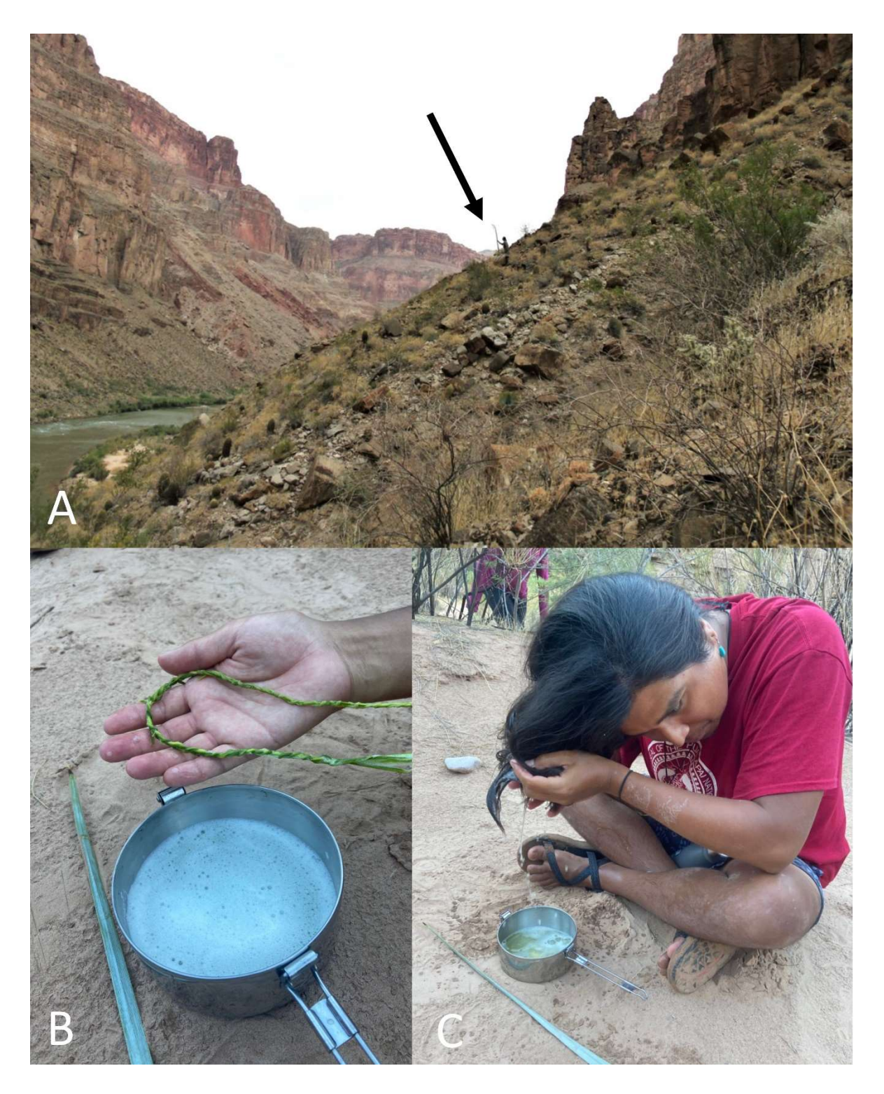
Agavaceae part 2: Hesperoyucca. Figure 4. H. newberryi . A. Typical habitat of steep, rocky slopes with most individuals appearing to occur on north- or northeast facing slopes. The flowering individuals are often few and far between; note the arrow pointing to a person next to a plant in the background. B. Although its uses are not well documented, leaf fibers soaked in water form a soapy liquid and can be braided. C. Vincent Diaz washing his hair wth soapy water from leaves soaked in water.