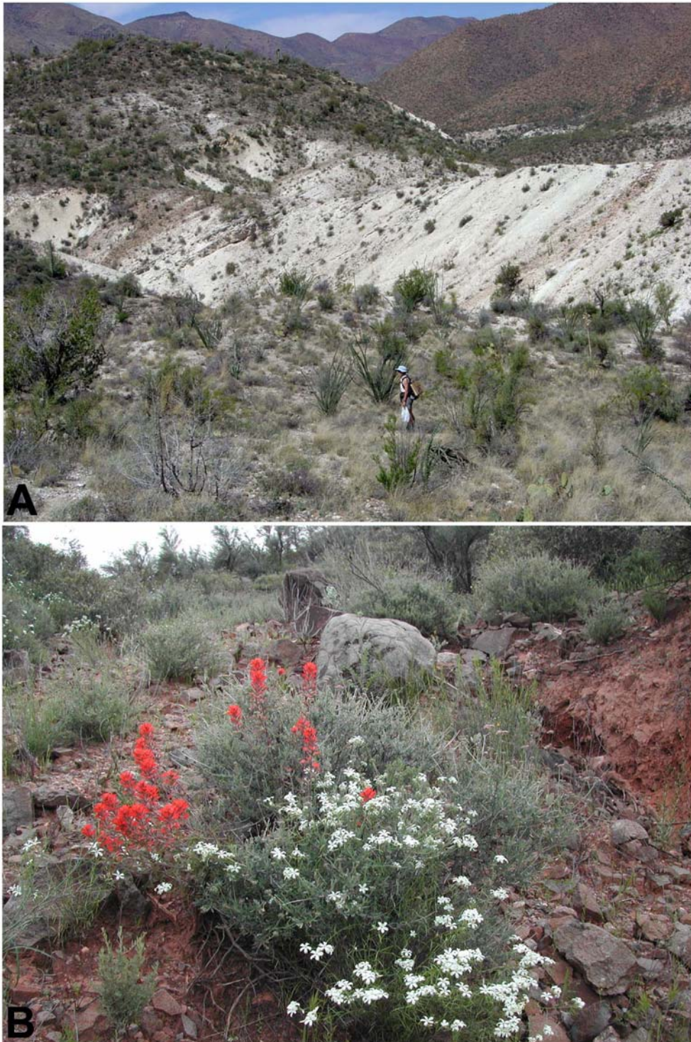
Lime Creek Flora Figure 2. (A) Rolling hillsides with lacustrine soils and sparse vegetation are very common throughout the study area; (B) Floral display including Phlox tenuifolia , Castilleja lanata , and Eriogonum fasciculatum var. polifolium found in one of the areas with mixed soil types.