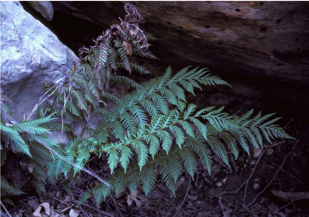
Blechnaceae Figure 3. Woodwardia fimbriata , leaves.