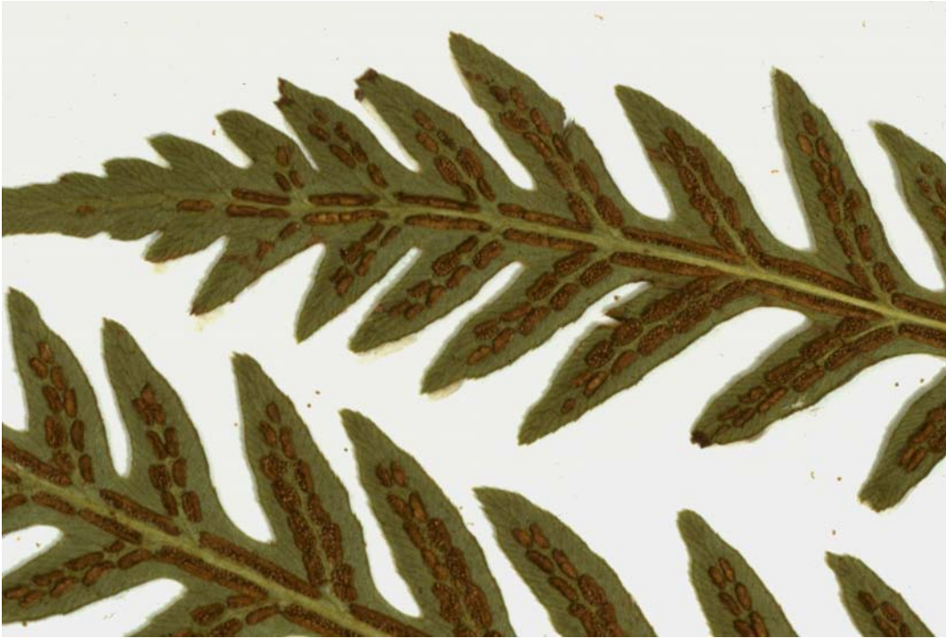
Blechnaceae Figure 2. Woodwardia fimbriata , pinnae.