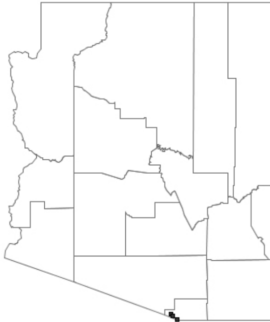
Psilotaceae Figure 1. Distribution of: Psilotum nudum .

CORRELL, D.S. and M.C. JOHNSTON. 1970. Manual of the Vascular Plants of Texas . Texas Research Foundation, Renner.